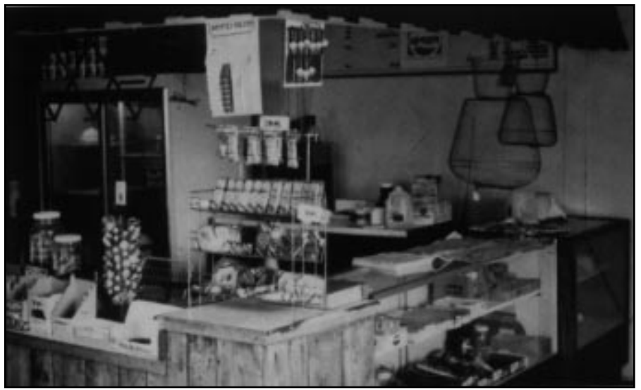
Concessions can increase profit potential.

Intensively managed fee-fishing operations should have multiple ponds. This enables the manager to better control fishing success and to isolate and treat diseases or other problems. If several ponds are available, the manager can move patrons to ponds where fish are actively biting, assuring successful and satisfied customers. Fish can be moved from one pond to another to increase densities and catchability. Also, fish of unknown condition (i.e., purchased off-farm) can be isolated in a separate pond away from other fish so there is no chance of disease transmission. If a single pond