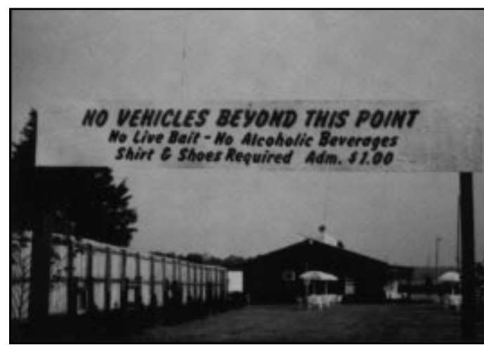
Regulations should be in obvious places.